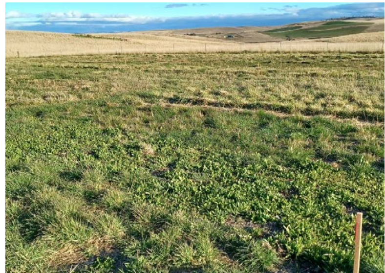
Trial plots at 'Burando' as part of the Resilient Pastures Project (Source: Nancy Spoljaric, MFS, 2024).

Evaluate pasture options specifically optimised for spring/summer lamb production enterprises. For example, grass and legume species that would provide strong quality and quantity options to finish lambs over the summer period as well as persist longer term, through seasonal challenges.