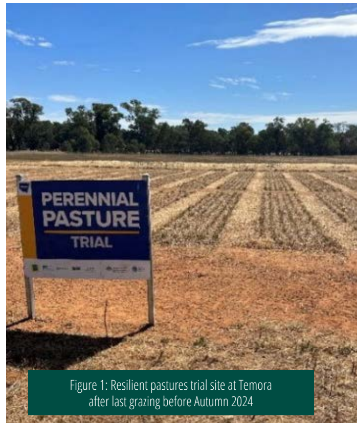
Figure 1: Resilient pastures trial site at Temora after last grazing before Autumn 2024

To ensure good establishment, the site was scarified and rolled to create a firm seedbed to sow into. The trial was sown as a small plot trial using knife point press wheels. No pre-emergent herbicides were used because of the variability between varieties and species in susceptibility. Post-emergence applications were made to relevant species where needed and insecticides were also used to protect seedlings.