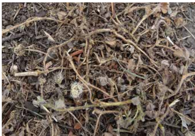
Mature sub-clover plants showing surface burr which contains seeds (important for re-establishment) much of which can be lost through grazing, predation or poor establishment.