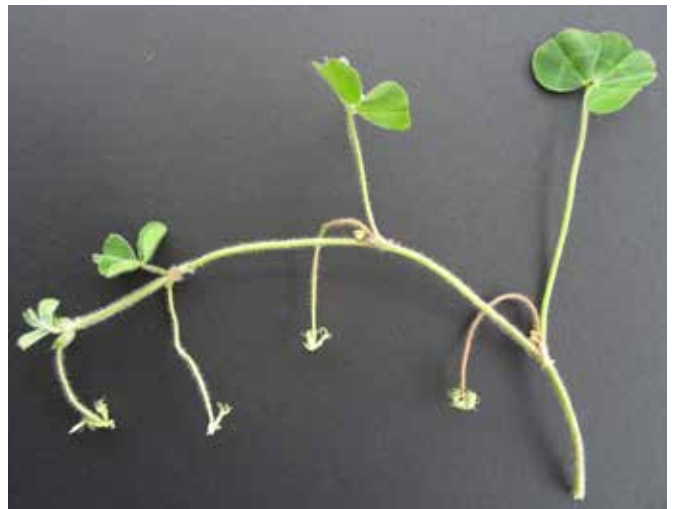
A sub-clover runner showing the development of burrs.

Burr buried in the soil is protected from grazing and is more likely to germinate successfully in subsequent years. Burr on the soil surface can be more readily grazed by sheep, is prone to predation and is less likely to establish successfully when it germinates because the root is exposed. Only 1% of the seed eaten survives the chewing and digestion process.