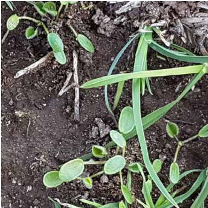
Germination of three cotyledons per palm size (8x8cm) is required to achieve at least 40% sub-clover in a pasture.

Being an annual, sub-clover needs to germinate and re-establish each year to contribute to the pasture mix. A pasture with adequate sub-clover relies on the successful germination of 20–30kg/ha of seed (30–45 plants in 0.1m 2 ). This will result in a pasture with at least 40% sub-clover content by late winter.