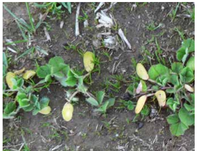
Sub-clover showing cotyledons dying 6–8 weeks after germination.

The seedling becomes less vulnerable to grazing after the appearance of the spade leaves because the seed stem (hypocotyl) is drawn below the soil surface, forming a tap root and anchoring the plant more securely. The growing point also retracts below grazing height.