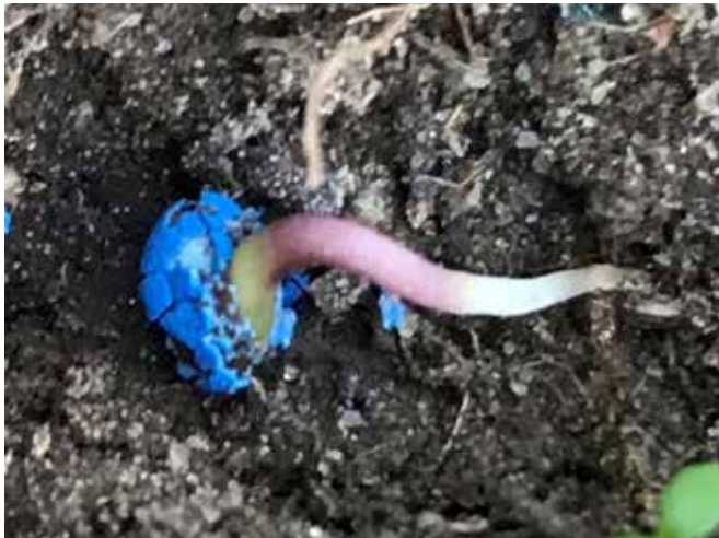
New root emerging from germinating sub-clover seed (blue coating is seed treatment).

Seed germination occurs once hardseededness has broken down, soil temperature is below 26°C and cumulative rainfall events are above 20mm. The dry seed absorbs moisture, initially producing a root called a radicle.