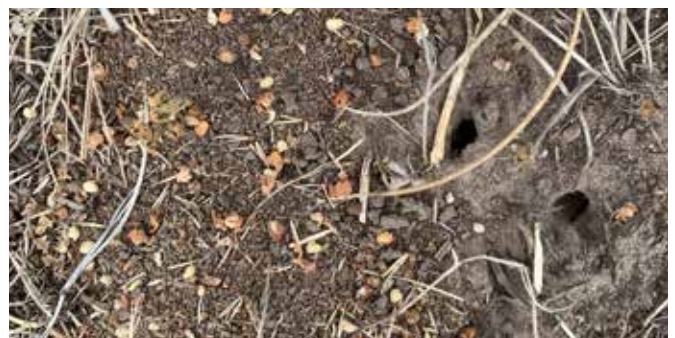
Ant predation of surface seed by stripping seed from burr to take down into nests.

Choosing cultivars that best suit the soil type, grazing approach and time of flowering to match growing season length is critical to the long-term success of a sub-clover pasture. 3