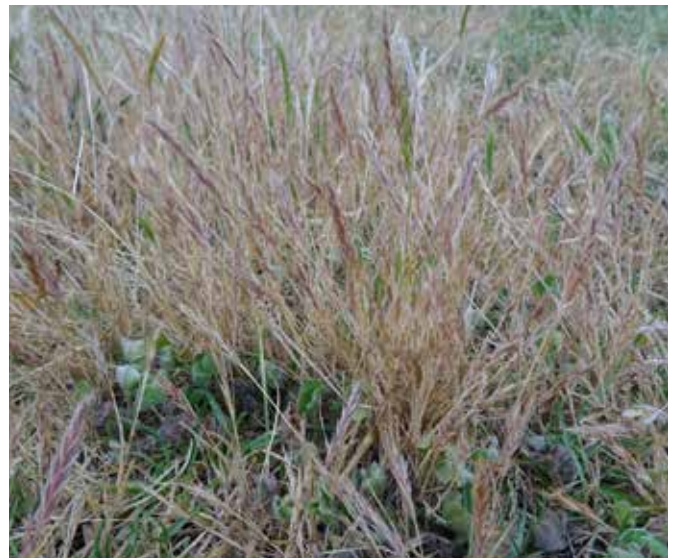
Dry silver grass will release a natural toxin that reduces the germination of sub-clover.

A compromise between protecting the soil, achieving hard seed breakdown and reducing the toxic effects is