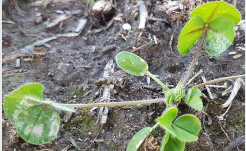
Redlegged earth mite damage on sub-clover seedlings.

Regular inspections should be made for pests, especially redlegged earth mite (RLEM) which hatch when there has been at least 25mm rainfall and average daily temperatures fall below 21°C.