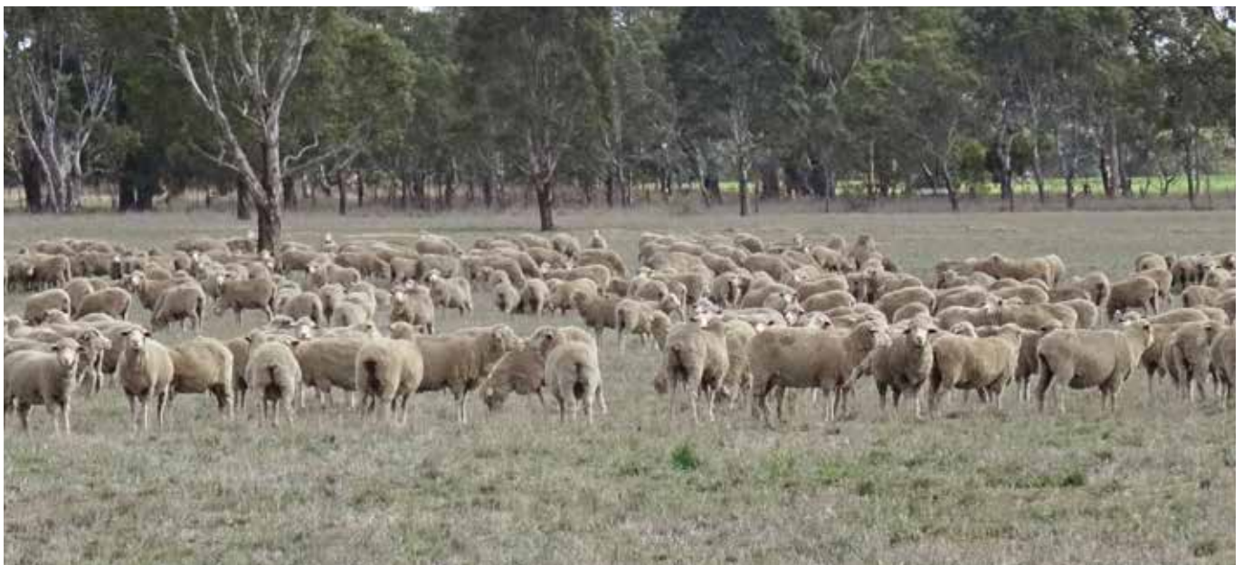
Grazing helps remove excess pasture litter to prepare the paddocks for sub-clover germination.

Source: Brogden, J (2019) The effect of trash on sub-clover germination. In '60th Annual Conference Proceedings'. Grassland Society of Southern Australia Inc. pp 86.