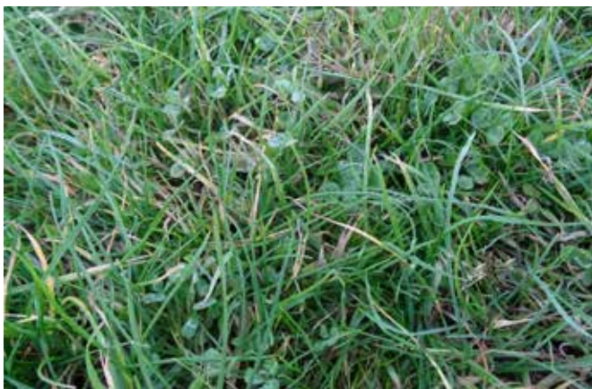
Lax grazing leads to sub-clover becoming shaded by grasses and reduced leaf initiation.

Maximum sub-clover leaf production is achieved by frequent heavy grazing, rather than light grazing and long periods of spelling. Sunlight reaching the crown of the sub-clover plant stimulates leaf production and shading reduces leaf production.