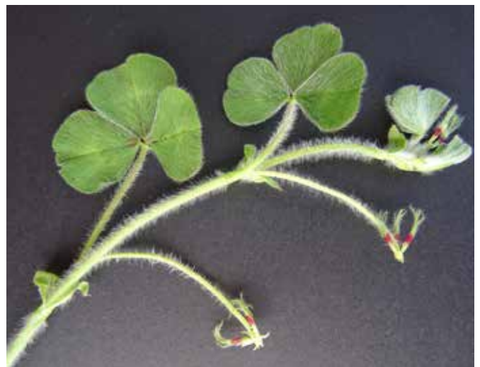
A sub-clover runner with the newest leaf emerging from the end of the runner and flowers at the stem intersection of each leaf.

Flowers and leaves grow from the same position on the runner. The flowers along each runner will be at different stages of maturity, with the oldest flower closest to the crown of the plant and the newest flower at the end of the runner.