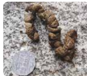
Quoll Scat. SN

Known from the upper slopes and mountains. Unconfirmed sightings recorded from Woomargama National Park.