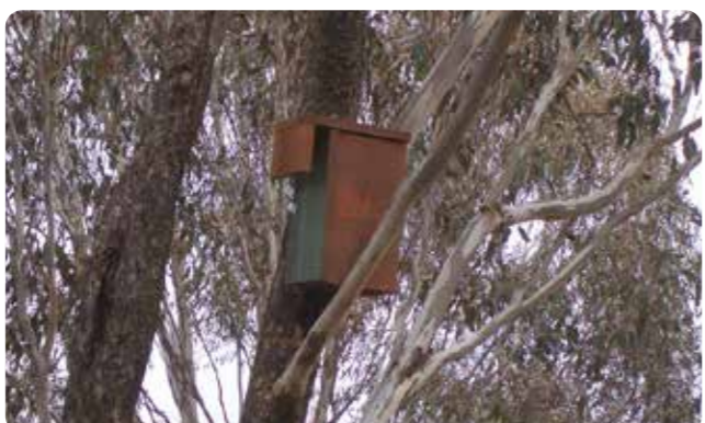
Nest box at Thurgoona. MLLS

Known from the upper slopes, there is also evidence of their presence in Woomargama National Park.