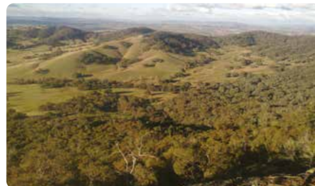
Typical slopes landscape. KD

Known from the upper slopes and lower slopes below 500 m elevation.