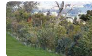
A revegetation site connecting isolated remnant fragments. SD

Fortunately, there has been significant investment by both public and private land managers in our region to conserve, enhance and establish vegetation. This helps to improve functional connectivity and habitat diversity, which also benefits land managers through the additional ecosystem services provided by vegetation such as shade, shelter, impact on water retention and quality, erosion control and pollination. Farmers in our region care about their stewardship of the land and want to leave their farms in better condition than they found it. We are lucky to have active landcare, community and producer groups that collaborate to support healthy, diverse and functioning landscapes.