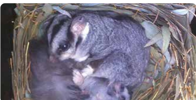
Gliders in a nest Box. SM

Known across the Slopes to Summit region.