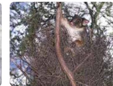
Ringtail Possum in a tree nest. PG