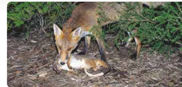
Fox with dead glider. PG

Manage the matrix – some farm practices can be sympathetic to our wildlife