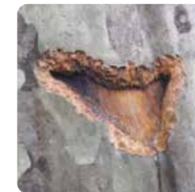
Typical scars left by Yellow Bellied Glider extracting sap. JP

Known from the upper slopes and mountains. An endangered population is present on the Bago Plateau.